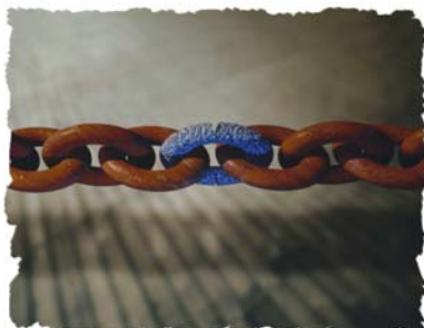
People are the Weakest Link!

infotex offers other training presentations for the various levels in your organization. The presentations are customized to your exact needs.