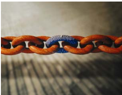
People are the Weakest Link!

infotex offers other training presentations for the various levels in your organization. The presentations are customized to your exact needs.